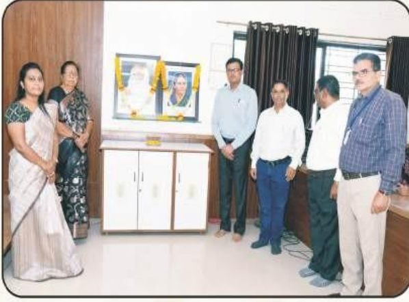
मान्यवरांच्या हस्ते प्रतिमापूजन