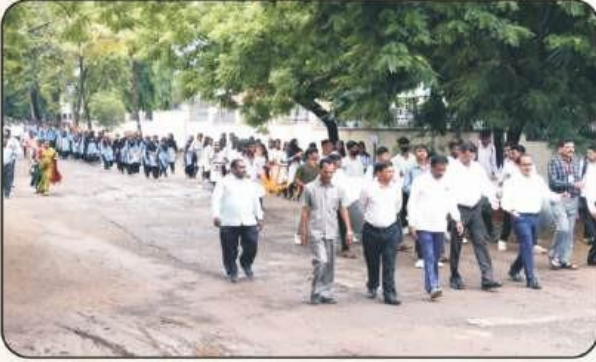
कर्मवीर जयंती निमित्त आयोजित रॅलीत सहभागी रयतसेवक व विद्यार्थी