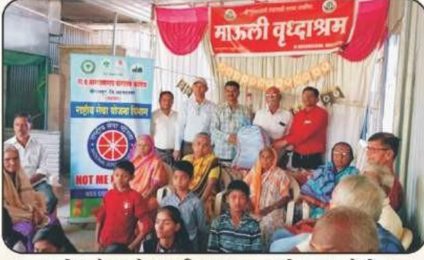
राष्ट्रीय सेवा योजना विभागाकडून श्रीरामपूर येथील माऊली वृद्धाश्रमाला मदतीचा हात