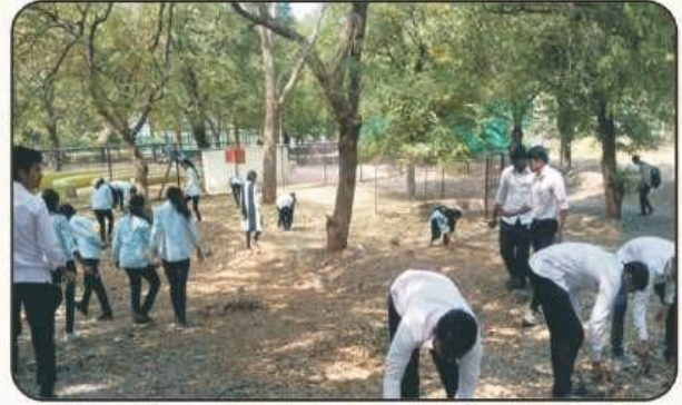
कॉलेज परिसर स्वच्छता करताना राष्ट्रीय सेवा योजनेचे स्वयंसेवक