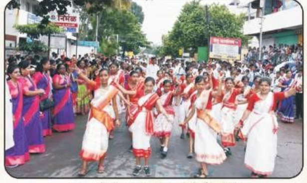
प्रभात फेरीत रममाण झालेले विद्यार्थी