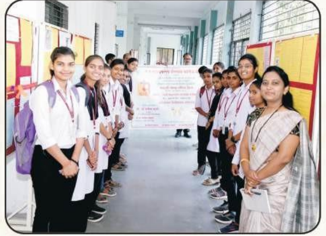
लेखन व वक्तृत्व कला जोपासणाऱ्या उत्साही विद्यार्थीनी