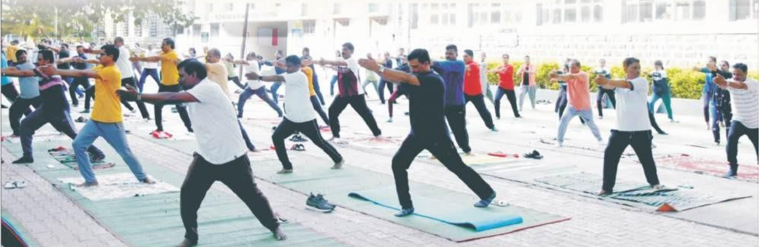
योग दिनानिमित्त योग प्रात्याक्षिक करताना रयत सेवक