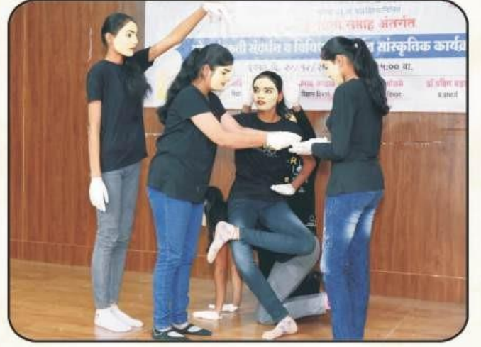
मुकनाट्य सादर करताना कलाकार