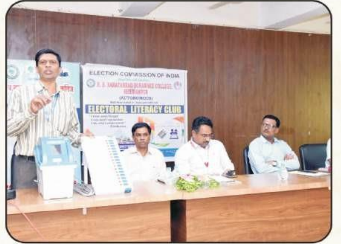
ई.व्ही.एम.ची माहिती देताना बी.एल.ओ. कर्मचारी