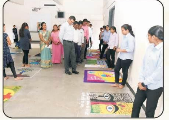
रांगोळी विषयी माहिती देताना स्पर्धेतील सहभागी विद्यार्थिनी