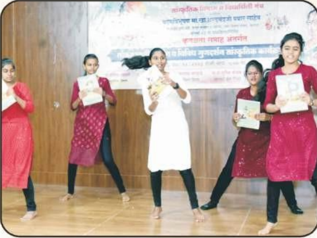
सामुहिक नृत्याविष्कार करताना विद्यार्थिनी