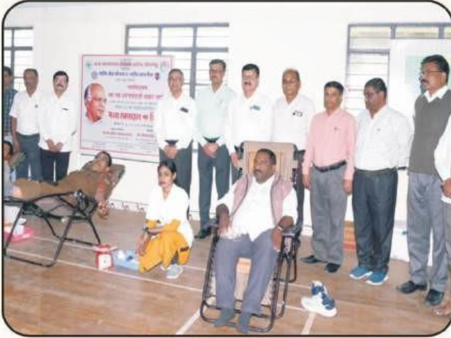
रक्तदान करताना प्राध्यापक