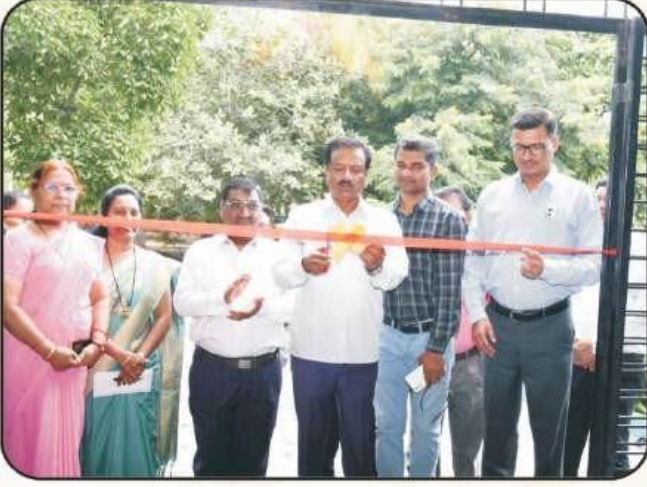
मान्यवरांच्या हस्ते उद्घाटन