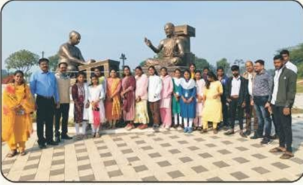
नेवासा येथे मराठी विभागाची अभ्यास सहल