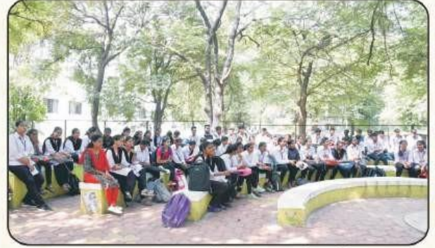
वाचन कट्ट्यावर उपस्थित वाचक विद्यार्थी