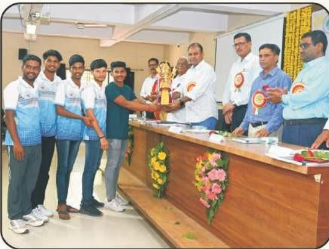
मान्यवरांच्या हस्ते पारितोषिक वितरण