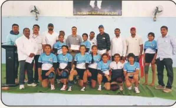
जिजामाता कॉलेज, भंडे येथे झालेल्या आंतर महाविद्यालयीन स्पर्धेतील महाविद्यालयातील मुलींचा विजेता संघ