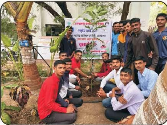
राष्ट्रीय छात्र सेना विभागातर्फे वृक्षारोपण करताना विद्यार्थी