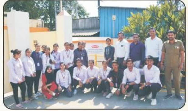
इंग्रजी विभागाची पार्ले जी कंपनी, खोपोली येथे क्षेत्रभेट