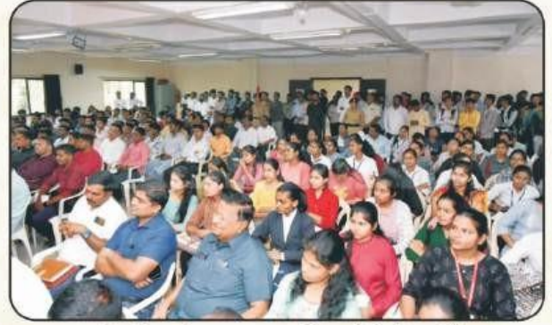
नोकरी महोत्सव सहभागी झालेले विद्यार्थी