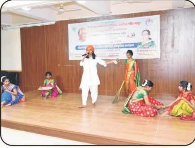
महाराष्ट्राची लोकधारा सादर करताना विद्यार्थिनी