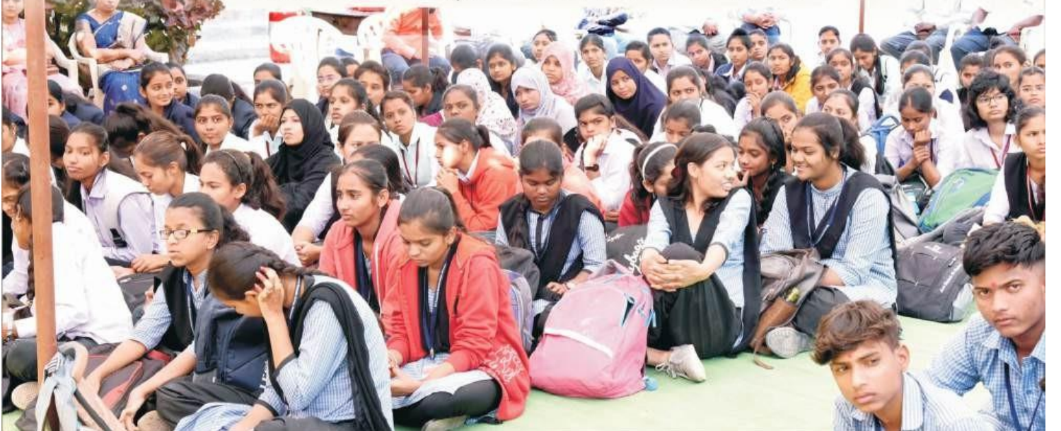
एन.एस.एस. शिबीराच्या उद्घाटन कार्यक्रमात सहभागी विद्यार्थी-विद्यार्थिनी