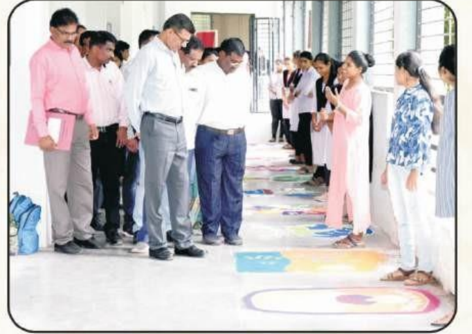
रांगोळी विषयी माहिती देताना स्पर्धेतील सहभागी विद्यार्थिनी