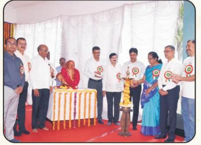
मान्यवरांच्या हस्ते प्रतिमापूजन