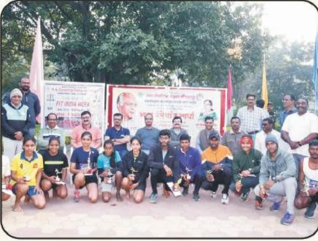
मॅरेथॉन स्पर्धेतील विजेते स्पर्धक