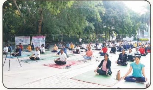
जागतिक योग दिनानिमित्त प्राणायाम करताना रयतसेवक