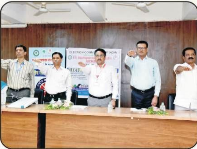
मतदार जनजागृती शपथ देताना मान्यवर