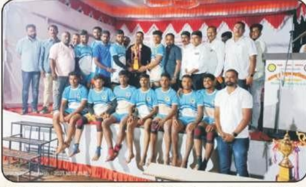
नूतन महात्मा फुले कॉलेज, मिरजगाव येथे झालेल्या आंतर महाविद्यालयीन कबड्डी स्पर्धेत चषक स्वीकारताना महाविद्यालयाचा उपविजयी संघ