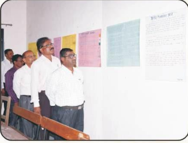
पोस्टर प्रेझेंटेशन पाहणी करताना मान्यवर