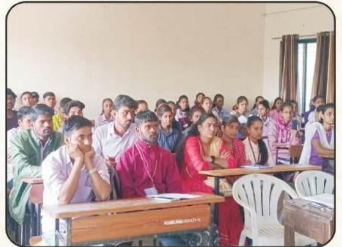
व्याख्यानमालेस उपस्थित विद्यार्थी