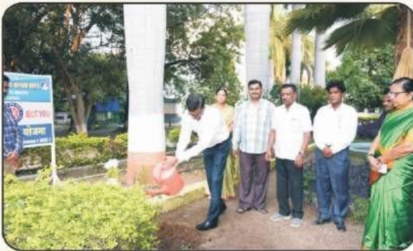
राष्ट्रीय सेवा योजना वृक्षारोपण प्रसंगी उपस्थित मान्यवर