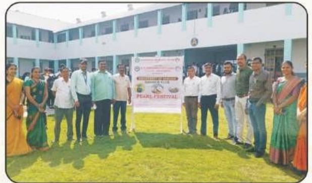
प्राणीशास्त्र विभाग फुड फेस्टिवल