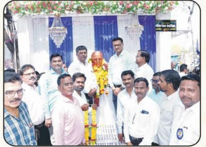
श्रीरामपूर शहरातील भारतरत्न डॉ. बाबासाहेब आंबेडकर यांच्या प्रतिमेस पुष्पहार अर्पण करताना मा. प्राचार्य व प्राध्यापक