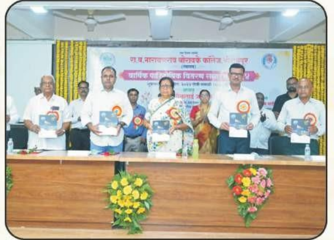
पूर्ती नियतकालिकाचे प्रकाशन करताना मान्यवर