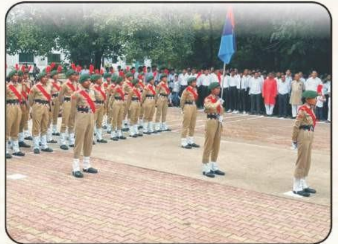
स्वातंत्र्यदिनानिमित्त राष्ट्रीय छात्र सेनेचे परेड संचलन