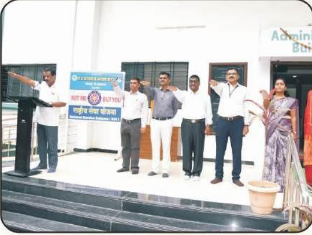
संविधान उद्देशपत्रिकेचे सामुहिक वाचन