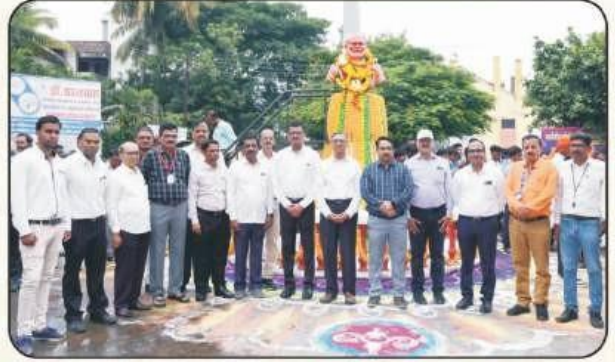
कर्मवीरांना अभिवादन करताना मान्यवर व रयत सेवक