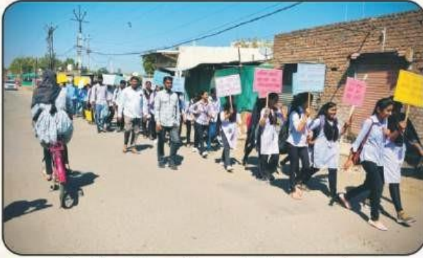
राष्ट्रीय सेवा योजना विभागाची श्रीरामपूर परीसरात निघालेली पर्यावरण साक्षरता रॅली