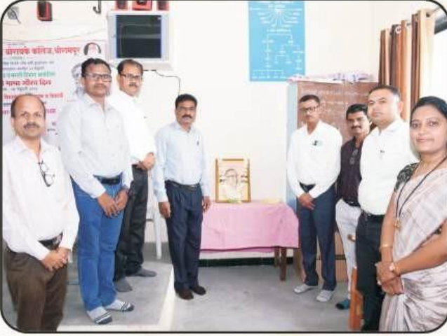
मान्यवरांच्या हस्ते कवी कुसुमाग्रज यांच्या प्रतिमेचे पूजन