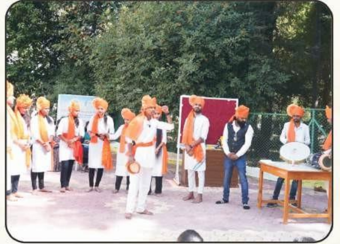
शिवरायांच्या जीवनावरील पोवाडा सादर करताना विद्यार्थी