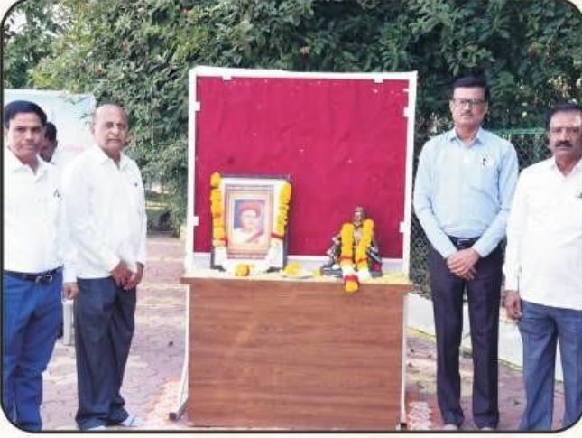
मान्यवरांच्या हस्ते प्रतिमापूजन