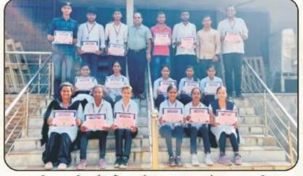
नवीन राष्ट्रीय शैक्षणिक धोरण २०२० अंमलबजावणी, ऑन जॉब ट्रेनिंग कोर्स पूर्ण केलेले रसायनशास्त्र विभागातील विद्यार्थी