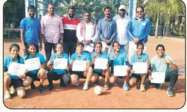
राधाबाई काळे महिला कॉलेज, अहमदनगर येथे झालेल्या आंतर महाविद्यालयीन हॅण्डबॉल स्पर्धेत महाविद्यालयातील मुलींचा उपविजेता संघ