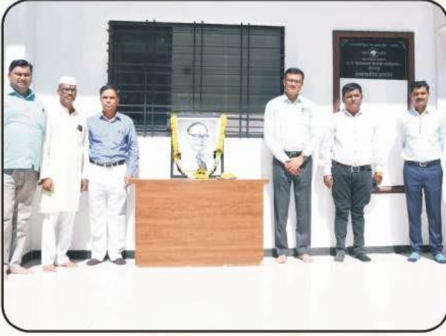
मान्यवरांच्या हस्ते प्रतिमापूजन