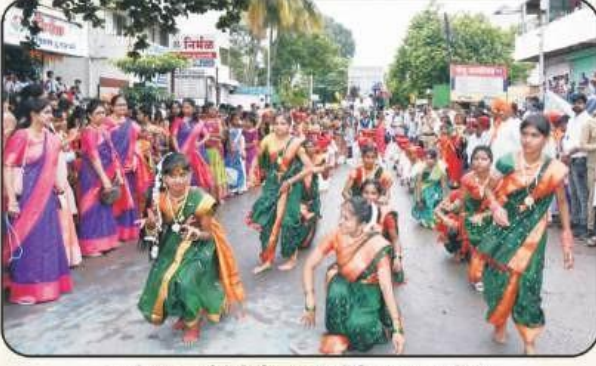
कर्मवीर जयंतीनिमित्त आयोजित प्रभातफेरी