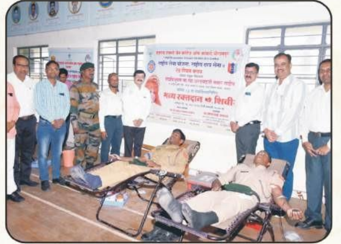
रक्तदान करताना एन.सी.सी. चे विद्यार्थी