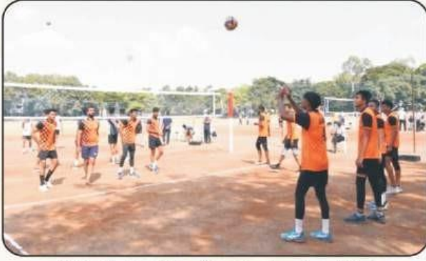
सावित्रीबाई फुले पुणे विद्यापीठ आंतर विभागीय व्हॉलीबॉल स्पर्धेतील एक क्षण