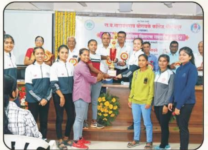
मान्यवरांच्या हस्ते पारितोषिक वितरण