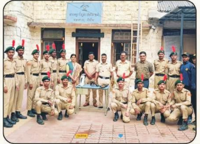
विद्यार्थ्यांना शस्त्रासाची माहिती देताना पोलीस अधिकारी